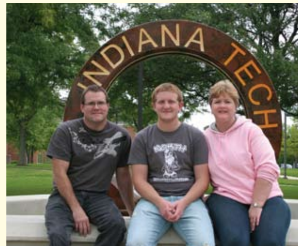
And while you're here, please try not to embarrass me too much by taking photos on campus where my friends can see me.

Fort Wayne Hotel and Conference Center 300 E. Washington Blvd. Fort Wayne, IN 46802 260-422-5511 www.ftwaynehotelconferencecenter.com