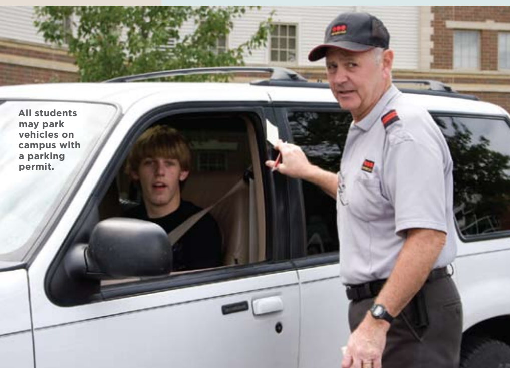
All students may park vehicles on campus with a parking permit.